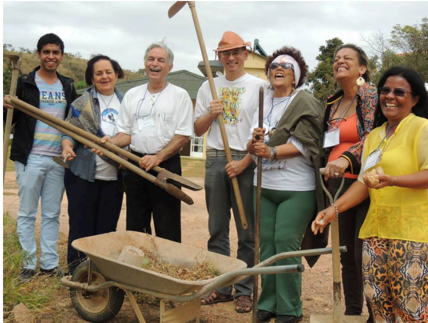
Belo Horizonte – Minas Gerais – Brazil – 2015