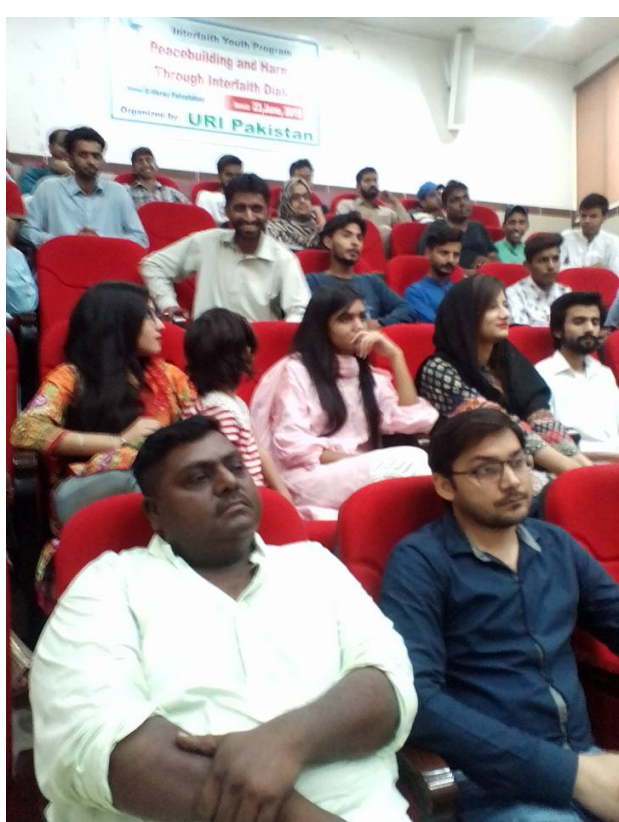
It is important for remember that no human life is outside of God's care.

We respect the uniqueness of each tradition, and differences of practice or belief. We value voices that respect others and believe that sharing our values and wisdom can lead us to act for the good of all. The objective of this training was to develop youth's awareness of diverse cultures and in so doing promote the development of positive attitudes in all youths towards our ethnic diversity as one people. By using diversity as the lens through which we view this topic, we will provide a mirror in which youth can see themselves as well as a window through which youth can more clearly see their sisters and brothers, and their role in promoting peace in this pluralistic society.