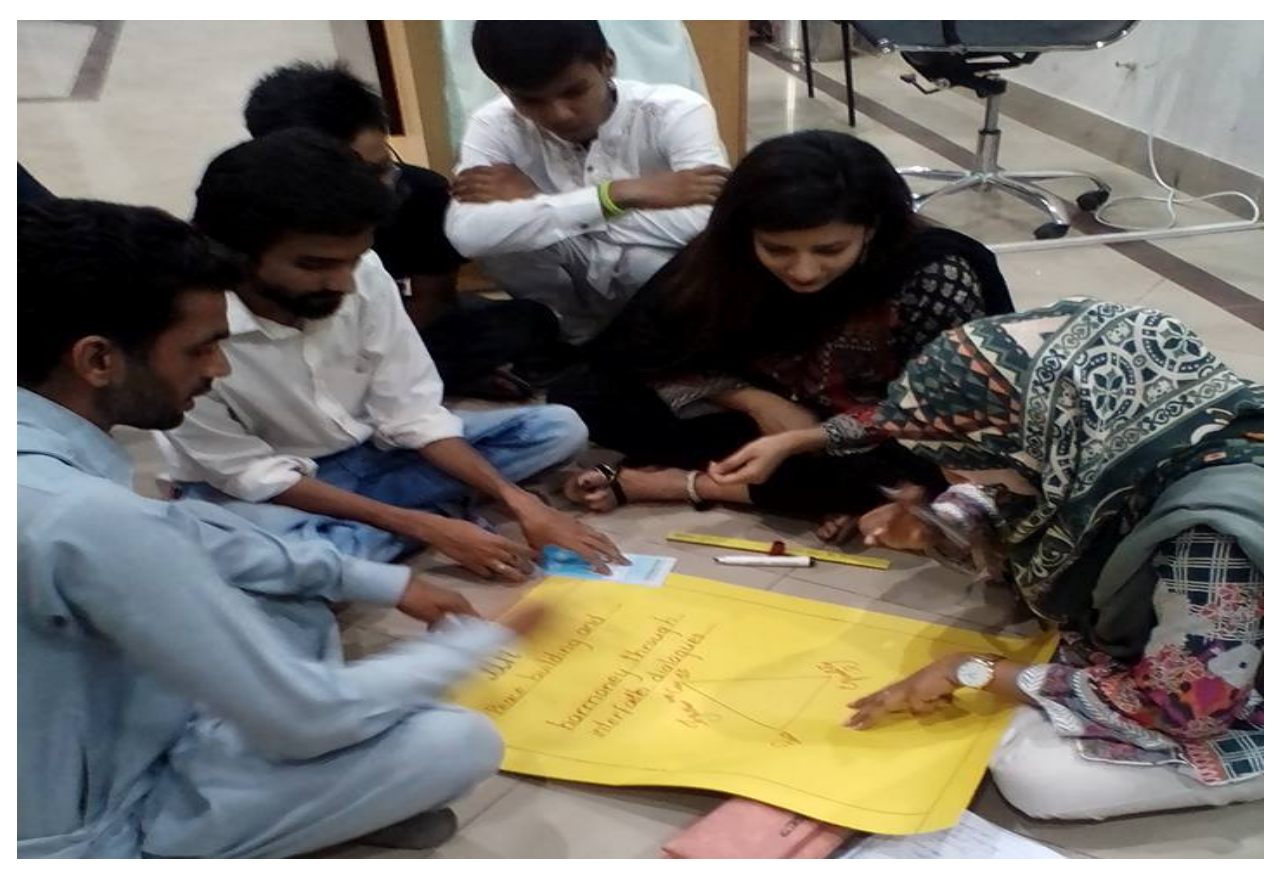
Together, interfaith youth are getting skills and knowledge about peace and interfaith harmony through exercise by listing and sharing experiences with another.